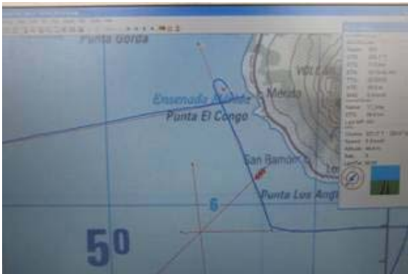
Fig. 14. Typical navigation display.

Navigation data are acquired from a portable GPS antenna or copied from the vessel's own GPS system (NMEA), if such is available (see Figure 14). Charts and real-time navigation can be displayed on a laptop using commercial software. Navigation data are also stored on disk and written into the SEG-Y trace headers. An additional navigation display may be located on the bridge, if necessary for steering the vessel.