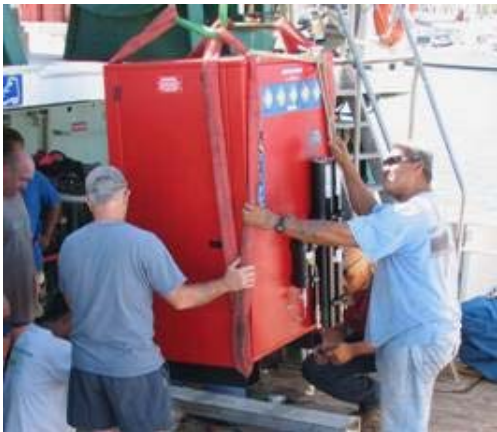
Fig. 8. Compressor being installed on deck, ALIS.

The more portable Max-Air 90 compressor is suitable for platforms with space or power constraints: