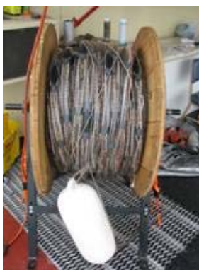
Fig. 19. Streamer and stand, Mississippi River, 2008.