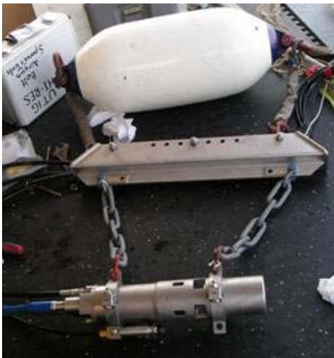
Fig. 5. Mini GI source with buoy and hanger.