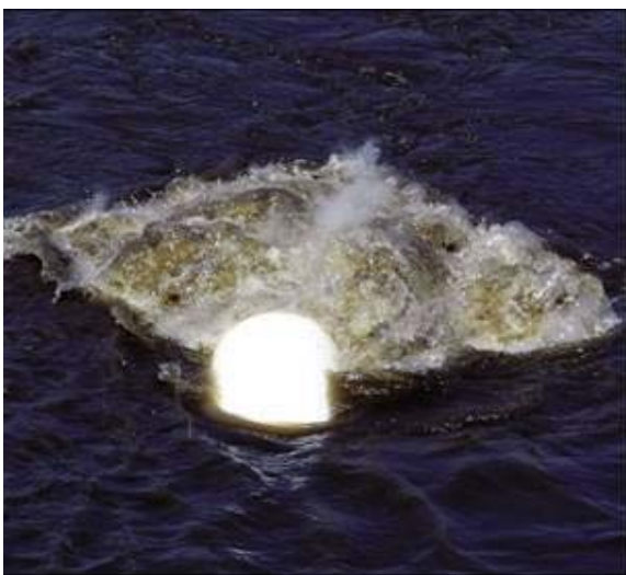
Fig. 6. Mini GI source firing.