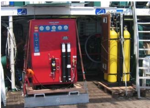
Fig. 11. Compressor and receiver installed on deck, ALIS.

The source is controlled by a Real Time Systems® (Fredericksburg, TX) HotShot firing controller (See Figure 12). This controller is capable of firing and synchronizing up to 4 Bolt airguns or 2 GI guns. Firing is triggered by an internal clock or an external signal.. The HotShot shotbox requires 110 VAC power.