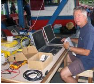
Fig. 13. Laptop/Geode/Shotbox set-up in the field: Nicaragua, 2006.