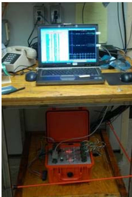
Fig 12. HotShot firing controller with firing laptop.

The source is controlled by a Real Time Systems® (Fredericksburg, TX) HotShot firing controller (See Figure 12). This controller is capable of firing and synchronizing up to 4 Bolt airguns or 2 GI guns. Firing is triggered by an internal clock or an external signal.. The HotShot shotbox requires 110 VAC power.