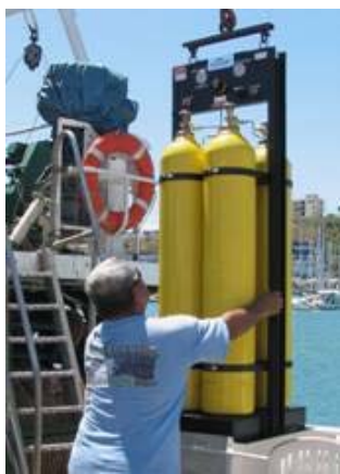
Fig. 10. Receiver being mounted on deck, ALIS.