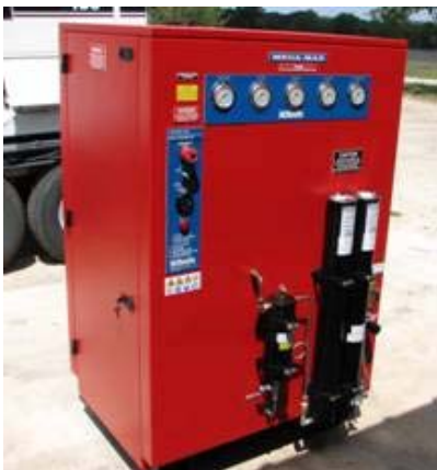
Fig. 7. Mega-Max Compressor.