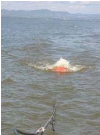
Fig. 4. Airgun towed behind a small