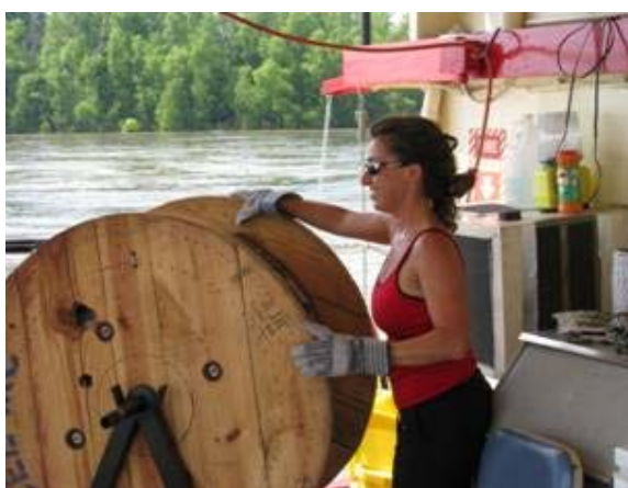
Fig. 2. Streamer deployed from shipping reel. Mississippi River, 2008