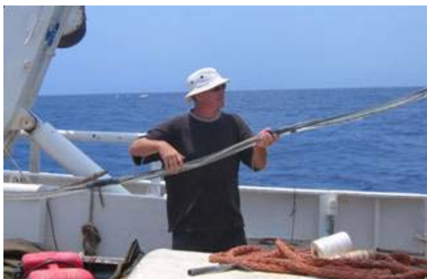
Fig. 18. Streamer deployment from ALIS, Sabine Bank, western Pacific, 2006.