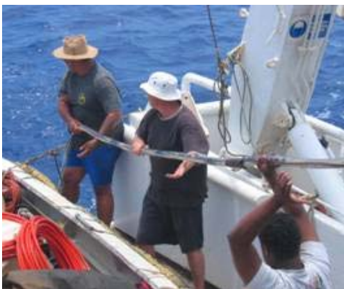
Fig. 15. Streamer deployment.

Towing strains are light enough for all deployments and recoveries to be performed by hand (see Figures 1, 15, 18). The system has been towed with as little as a 40 hp outboard motor. Typically, the source and the streamer are kept a minimum of 2 m apart laterally to protect the cable. The source and the nearest active channel are both generally located ~15 m astern of the vessel, at which distance the source is barely audible aboard the vessel. A turn radius as small as 100 m is possible with the cable deployed.