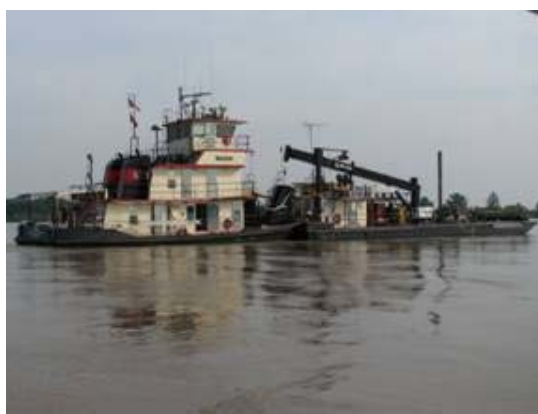
Fig. 20. Five of the vessels that have towed the UTIG system.