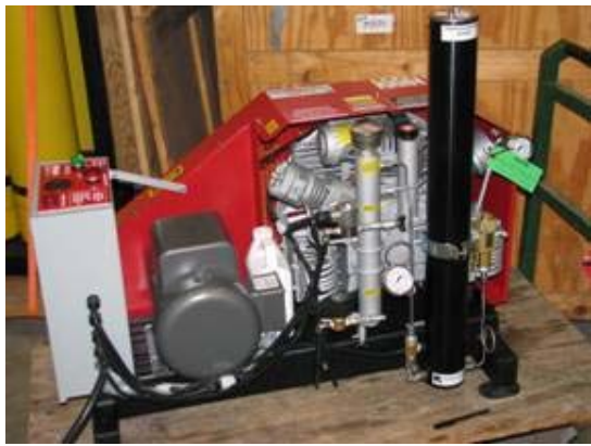
Fig. 9. Max-Air 90 compressor. Pen for scale at bottom right.

Either compressor can be located indoors or on deck, provided the deck area is well ventilated and at least partially protected from the elements. Compressor operation is automated and relatively quiet compared to gasoline- or diesel-powered compressors.