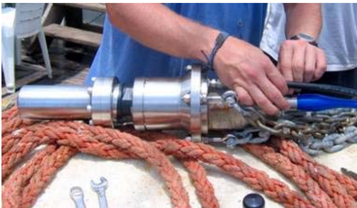
Fig. 3. Bolt 600BT sound source equipped with 20 in 3 chamber. vessel, Lake Nicaragua, 2006.