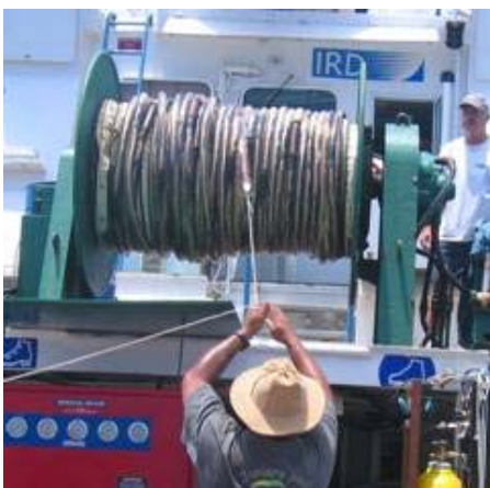
Fig. 1. Streamer deployed from winch drum. Sabine Bank, Western Pacific, 2006

The seismic receiver is a Beam Systems, Inc.® (Pearland, TX), 100m (75 m active), 24-channel, oil-filled, analog cable (see Figures 1, 2). 72 hydrophones (Teledyne Model T-2) are grouped three to a channel, group spacing is 3.125 m. The cable is 1.6 inch in diameter, liquid filled (Isopar M fluid). Nominal tow depth is 1 m or less. The cable can be easily deployed directly from the wooden shipping reel (see Figure 2) by hand, or can be wound around any available winch drum for mechanical deployment/recovery. A second, identical streamer is kept as a spare.